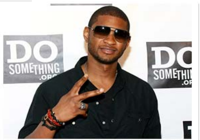
Usher attends the sixth annual Do Something Awards at the Apollo Theater